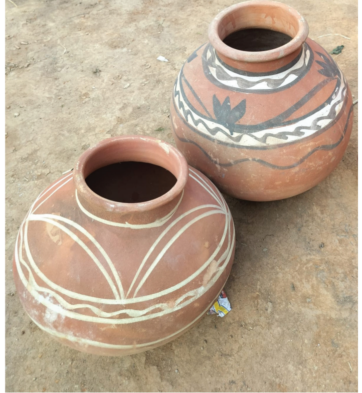
Fig. 9: Clay Pots Used as Musical Instruments

It serves as an interpretive extension of the profound spiritual themes found in the Vedas and transforms abstract Vedic concepts such as the eternal soul, the cycle of birth and rebirth, and the nature of divine knowledge into a format that is both entertaining and enlightening. The song begins by narrating how Goddess Parvati is instigated by Narad Muni (known for his role as a divine messenger and instigator) to learn the ultimate truth of immortality from her husband, Lord Shiva .