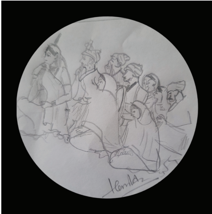
Fig. 3: Sketch of Folk singers gathered for singing in the Pahari Miniature Style of Painting