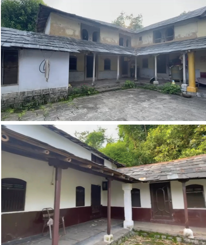
Fig. 1: Pictures of Traditional Houses of Kangra

continuity, which links the past with the present; variation, which emerges from the creative expressions of individuals or groups; and selection by the community, which determines the forms in which the music survives (Lloyd 15).