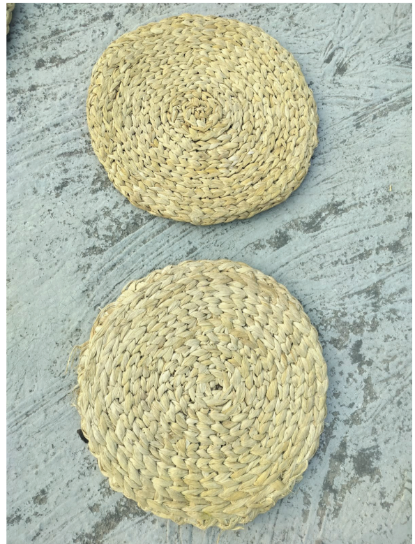
Fig. 6: Traditional Mats (Binnes and Pands) are used for seating

These pieces are not just simple weaves of straw; they are pieces of history. In many homes like hers, they lie tucked away in dusty trunks, like forgotten artefacts, their once-vibrant patterns dulled by time. Perhaps, one day, these mats will find their way into museums, where people will stare at them behind glass cases, reading plaques about their significance. But will they be able to understand the stories woven into their fibres?