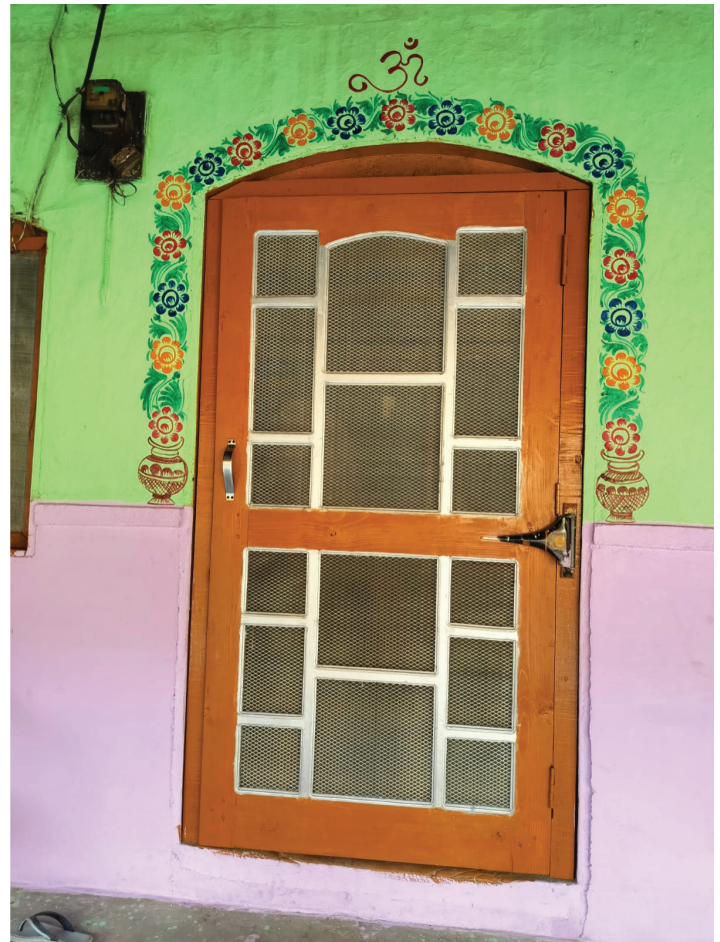
Fig. 2: Traditional Art on Doorways and Windows (Likhnus)

( Bauhinia variegata ). In this idyllic setting, the people of Kangra live in harmony with nature, celebrating life's joys through dance and song.