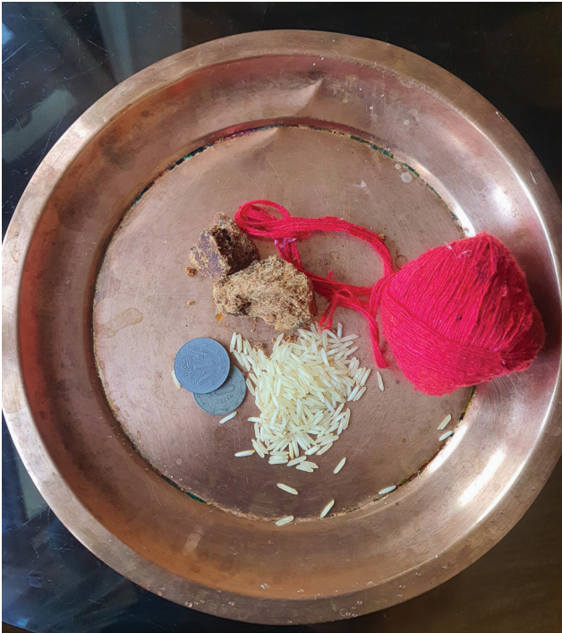
Fig. 8: Items used for sanctifying Musical Instruments

As mentioned in this folksong, the singers used a range of musical instruments, such as clay pots, metal plates for lids, rings, kansi (two small metal plates held by a length of rope), chimta (a pair of iron tongs), etc. The instruments are sanctified first by tying a molly (red thread), putting some rice and jaggery, and a one-rupee and twenty-five-paise coin in the pot. These simple acts would teach them the importance of giving before receiving, gratitude, and the deep interconnection between art and spirituality in community life. The constant usage of phrases in this folksong, such as “ Guru apne nu yaad karke ”, emphasises the custom of paying respect to the Guru before performing any important deed.