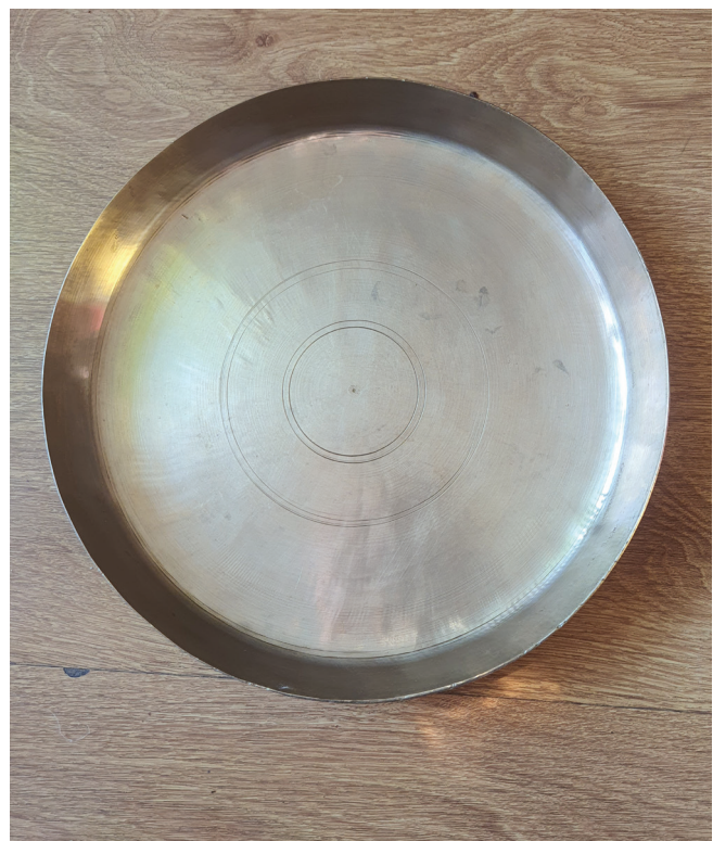
Fig. 7: Metal Plate (Kanse ki Thali) used as a Musical Instrument

O my devotees, hear my plea, Bow to the poet, blessed be he.